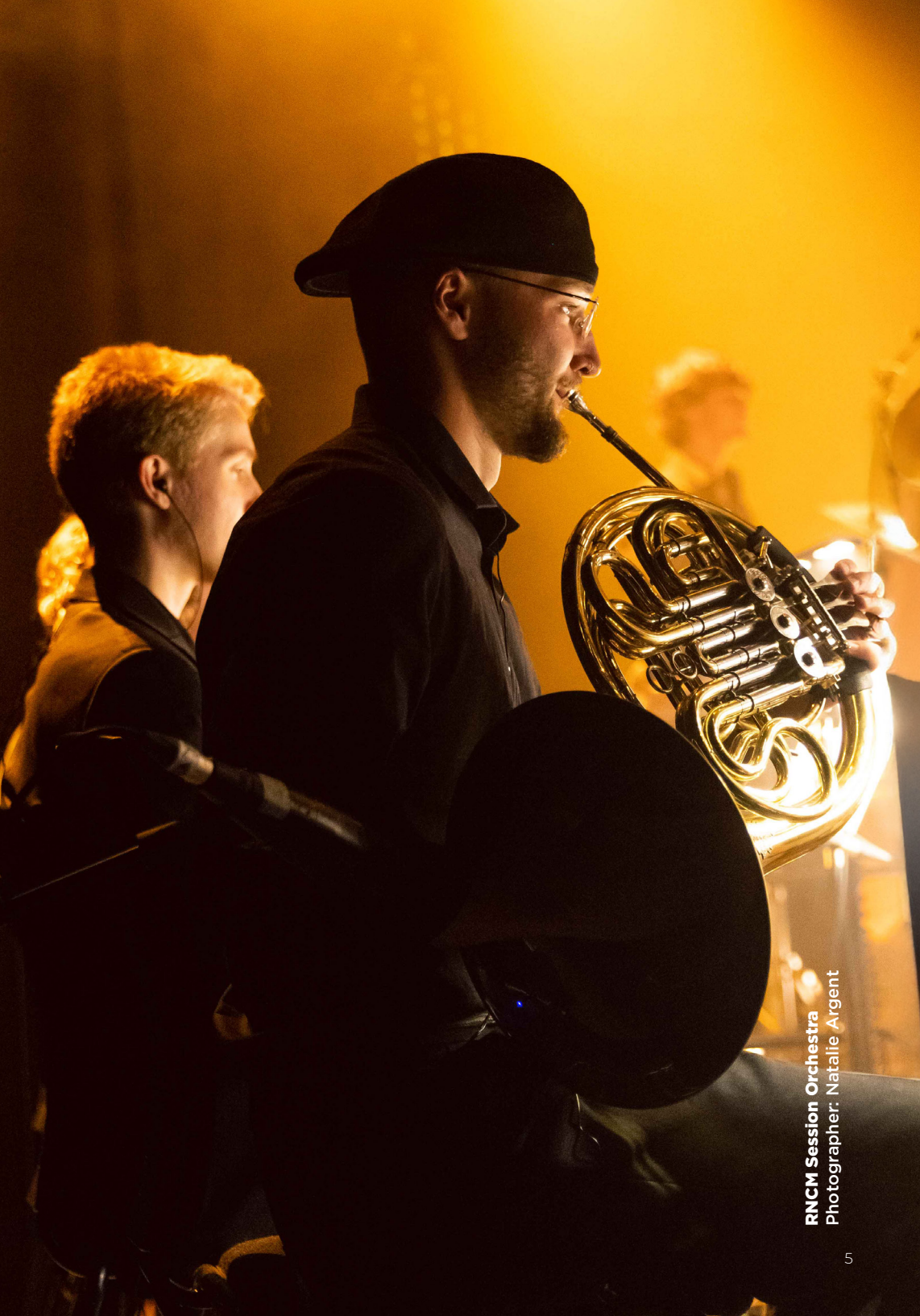
RNCM Session Orchestra