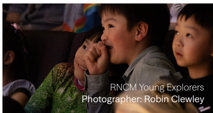
RNCM Young Explorers

A family-friendly afternoon of live orchestral music, including Revolting Rhymes Part 2 with film