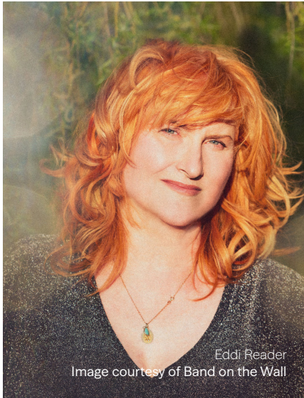
Eddi Reader

RNCM Chamber Ensemble performs with principals from Royal Northern Sinfonia