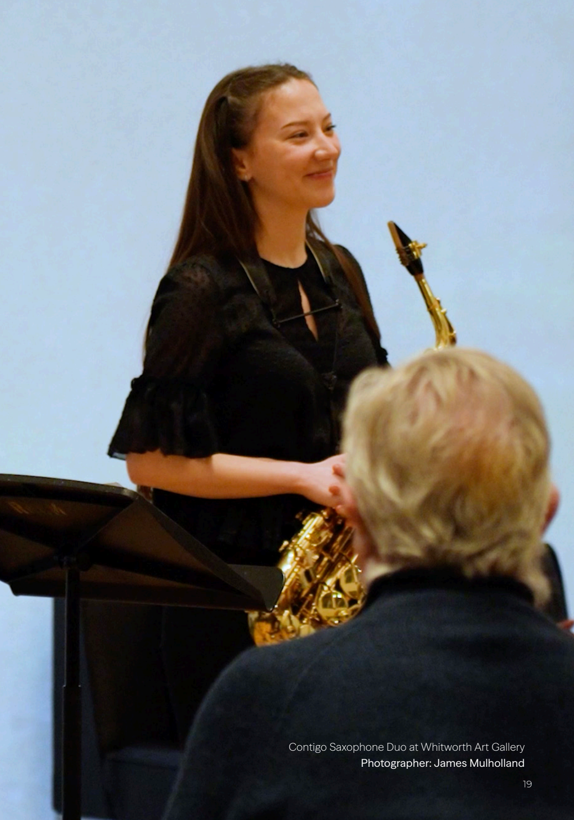
Contigo Saxophone Duo at Whitworth Art Gallery