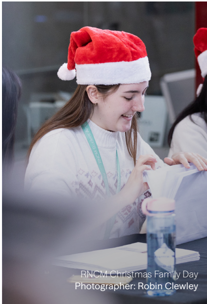
RNCM Christmas Family Day

SUN 20 DEC | 10AM AND 1.30PM VARIOUS VENUES | FULL: £16