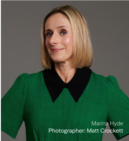
Marina Hyde

The Irish comedian brings his stand-up to Manchester, promoted by Live Nation in association with UTA