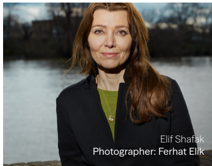
Elif Shafak

One of Pakistan's most celebrated female vocalists joins her band for a soulful fusion performance, promoted by Black Box Sounds