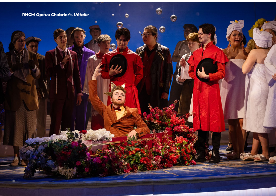
RNCM Opera: Chabrier's L'étoile

Members of our Opera Circle enjoyed unrivalled behind-the-scenes access during the planning and rehearsal process of our productions including meeting the cast and creatives, touring the stage and set, a preview of costumes, and the stage model box showing.