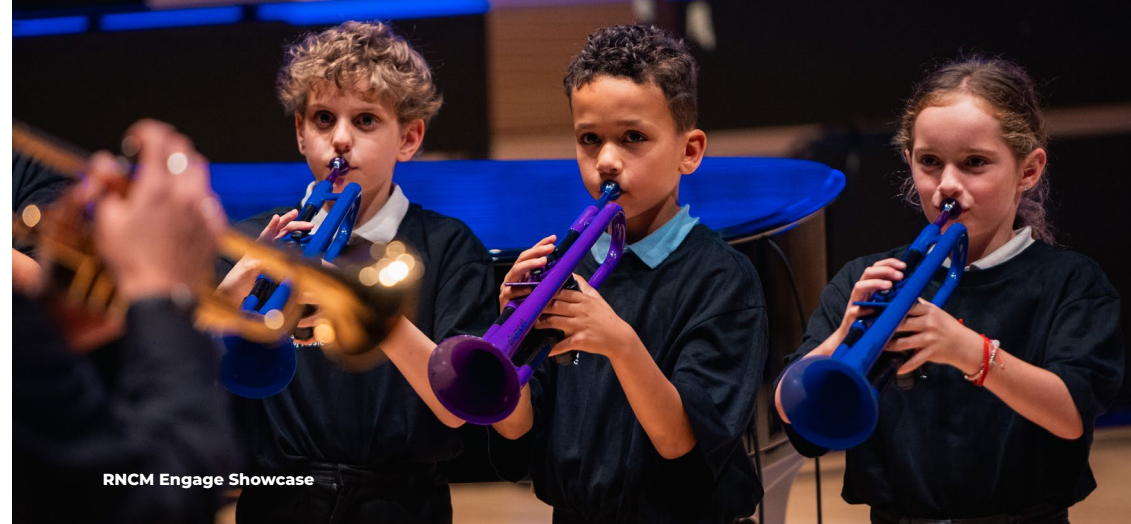
RNCM Engage Showcase

This year, we were delighted to launch Vocal Pathfinder in partnership with One Education Music, supporting talented young vocalists by developing a direct pathway to RNCM Young Artists, as well as working closely with two schools in East Manchester to deliver taster sessions, workshops, and weekly rehearsals.