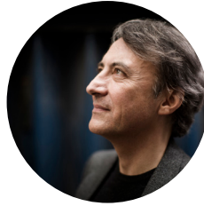
JEAN-EFFLAM BAVOUZET (FRANCE)

Award-winning pianist Jean-Efflam Bavouzet enjoys a prolific recording and international concert career. He regularly works with The Cleveland, San Francisco Symphony, BBC Symphony and London Philharmonic orchestras, NHK Symphony Orchestra, and collaborates with many renowned conductors including Vladimir Jurowski, Gianandrea Noseda, François-Xavier Roth, Vasily Petrenko, Ludovic Morlot, Edward Gardner, Louis Langrée, and Sir Andrew Davis.