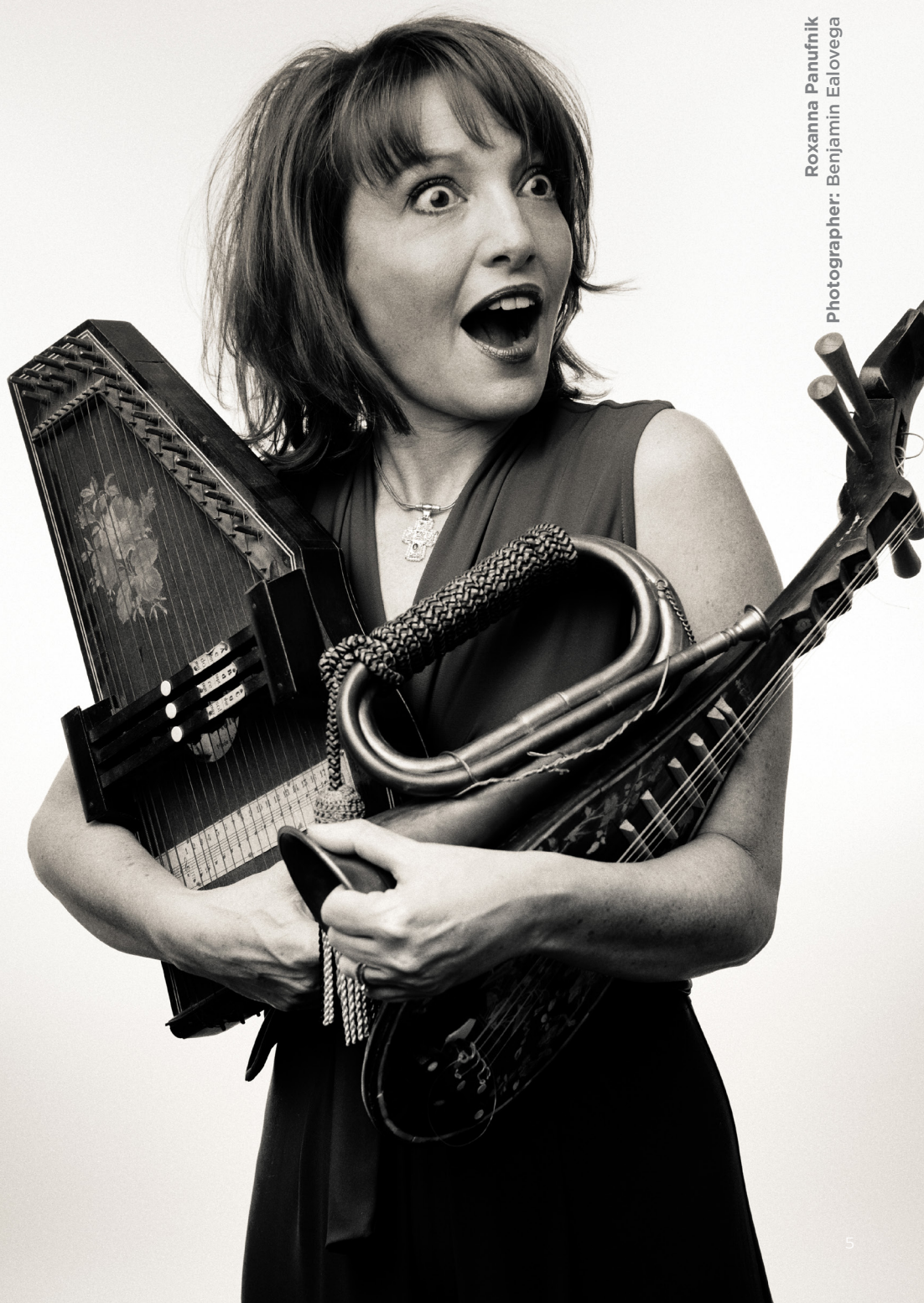
Roxanna Panufnik